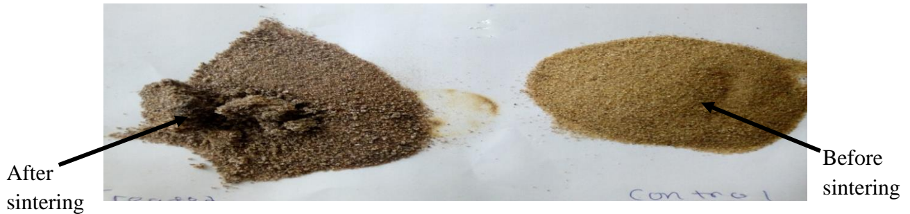
Figure 3: Isasa River sand samples